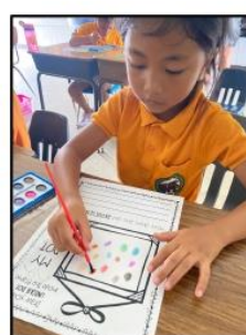
CELEBRATING DOT DAY