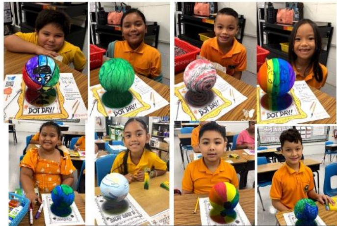
Celebrating International Dot Day!