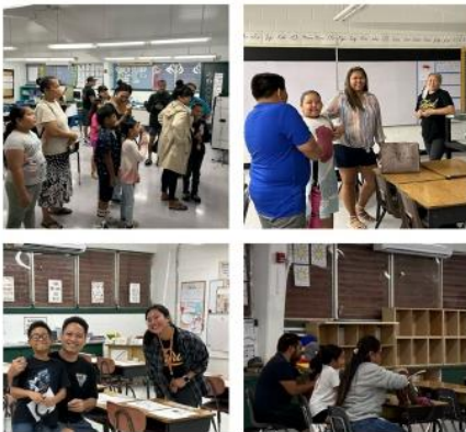
Thank you for coming to Parent Night!

SOCIAL STUDIES: I can identify and explain which continent is located near a specific ocean.