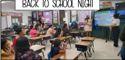
BACK TO SCHOOL NIGHT