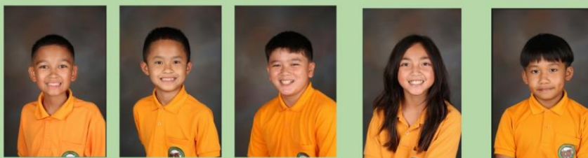
4th Grade Cool Carabao Kids

Congratulations to our Cool Carabao Kids for the month!