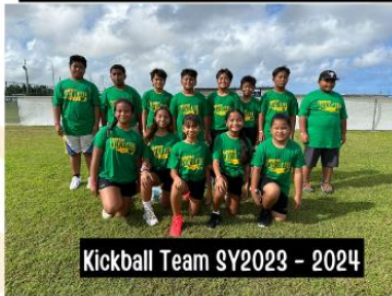
Kickball Team SY2023 - 2024