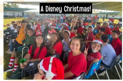
A Disney Christmas!