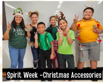
Spirit Week - Christmas Accessories