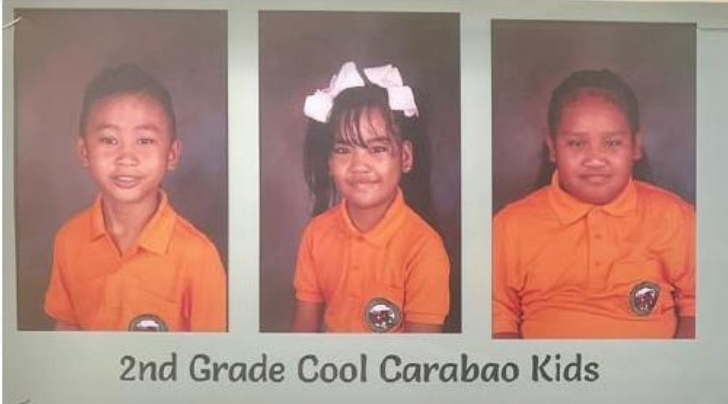
2nd Grade Cool Carabao Kids