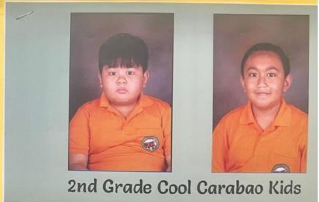
2nd Grade Cool Carabao Kids