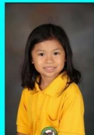
Kindergarten Cool Carabao Kids