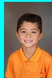
Kindergarten Cool Carabao Kids