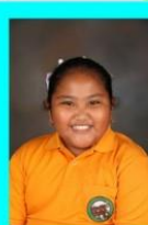
4th Grade Cool Carabao Kids